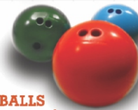
RUBBER BOWLING BALLS (3YR GUARANTEE)