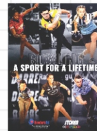
POSTER COUPON BOOK